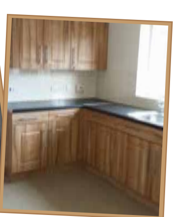
If you cause any form of damage or leave the property in poor condition, you will be charged.